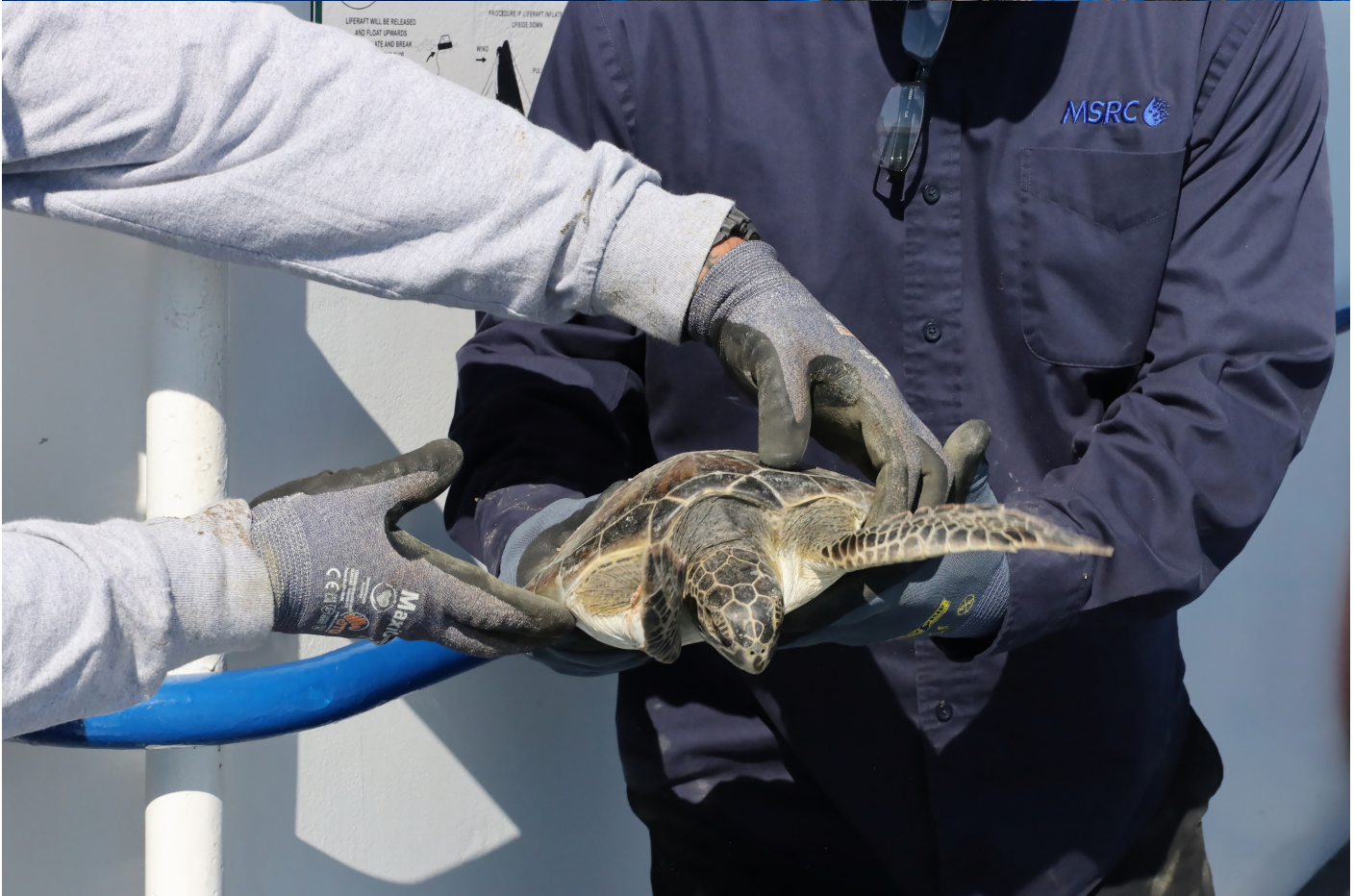
Handing off green sea turtles one by one in a human chain formation to load the turtles onto the upper decks of the Southern Responder.