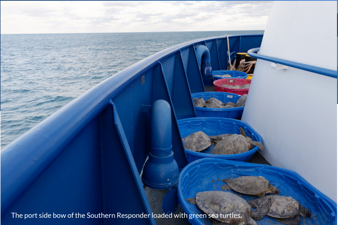
The port side bow of the Southern Responder loaded with green sea turtles.