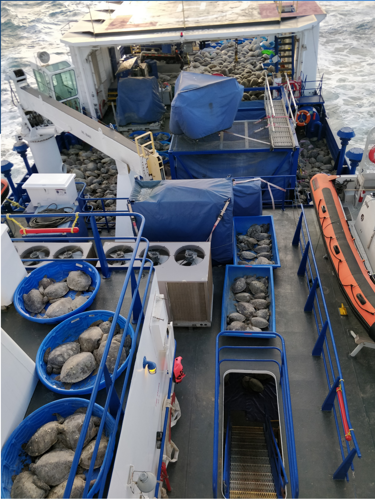
All three decks of the Southern Responder oil spill response vessel loaded with green sea turtles, heading offshore to warmer waters for their release.